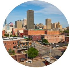
September 11–13, 2023 Oklahoma City, OK