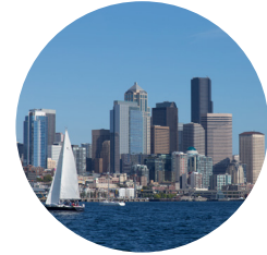
April 10–12, 2024 Seattle, WA

Visit www.nicwa.org/training-institutes for more information.