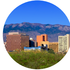
January 9–12, 2024 Albuquerque, NM