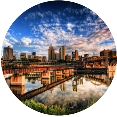
June 6–8, 2023 St. Paul, MN